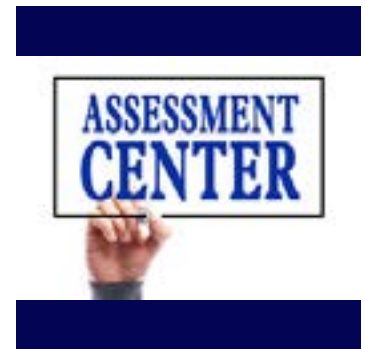
Assessment Center News