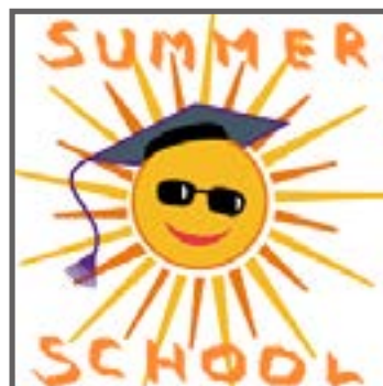
Summer School Information