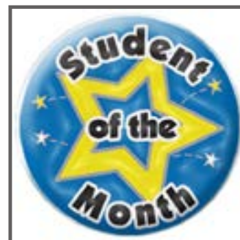
Student of the Month