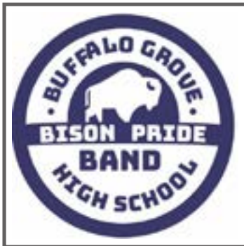
Bison Pride Band Update

CLICK ON AN IMAGE BELOW TO JUMP TO THAT PAGE