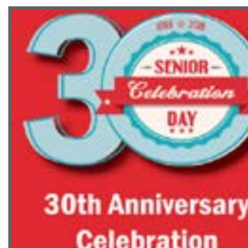
Senior Celebration Day