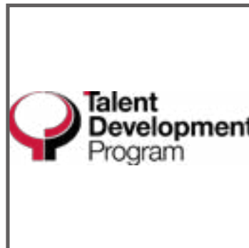
TDP Summer Enrichment Program