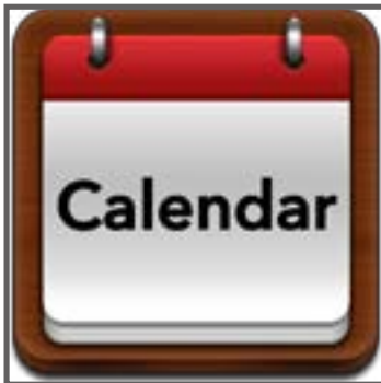
2017-18 Calendar & 2018-19 Calendar

CLICK ON AN IMAGE BELOW TO JUMP TO THAT PAGE