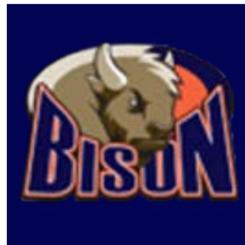
Bison Boosters and BGPA