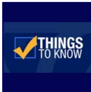
Important Things You Should Know