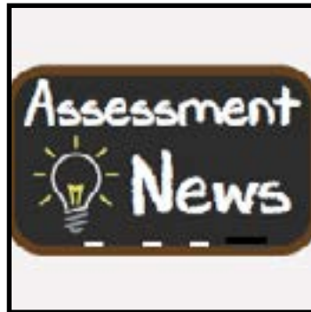
Assessment Center News