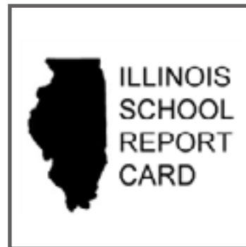
BGHS School Report Card