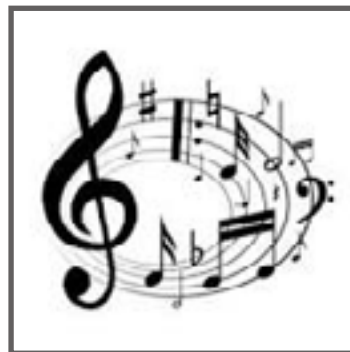
Choral Guild News