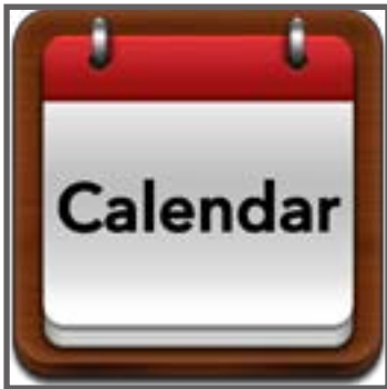
2019-20 & 2020-21 Calendars

CLICK ON AN IMAGE BELOW TO JUMP TO THAT PAGE