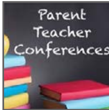
Parent Teacher Conferences