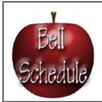
Bell Schedules with Final Exams