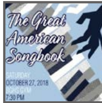
40th Annual Pops Concert