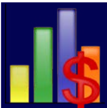
District 214 Budget