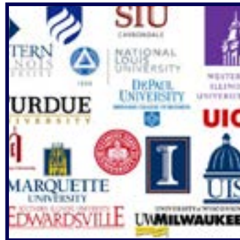
Una Feria de Colegios y Carreras