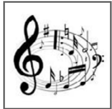
Choral Guild News