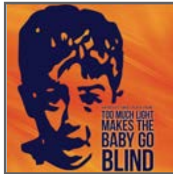
Fall Play October 19&20