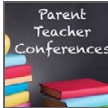
Parent Teacher Conferences