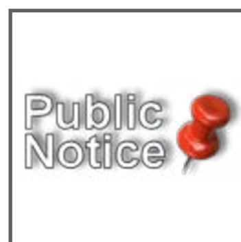
Asbestos, Pesticides & Controversial Issues