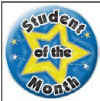
Student of the Month