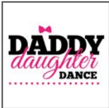
Daddy Daughter Dance