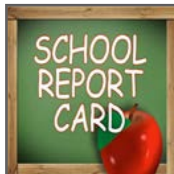
D214/BGHS School Report Card