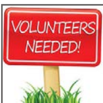
BGPA Volunteers Needed