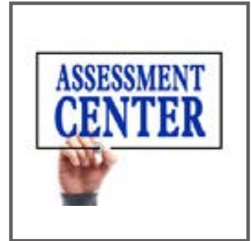
Assessment Center News