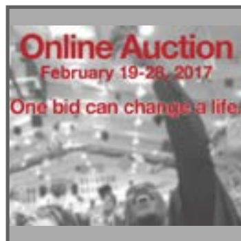
District 214 Online Auction