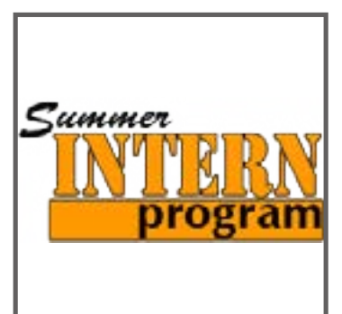
District 214 Summer Intern Program