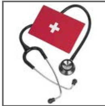
News from the Nurse's Office