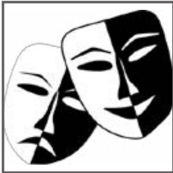
2017-18 Theater Arts Membership

CLICK ON AN IMAGE BELOW TO JUMP TO THAT PAGE